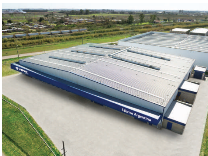
FACTORY IN PEREZ / SANTA FÉ - ARGENTINA