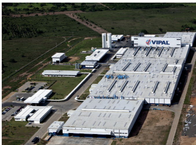
FACTORY IN FEIRA DE SANTANA / BA - BRAZIL