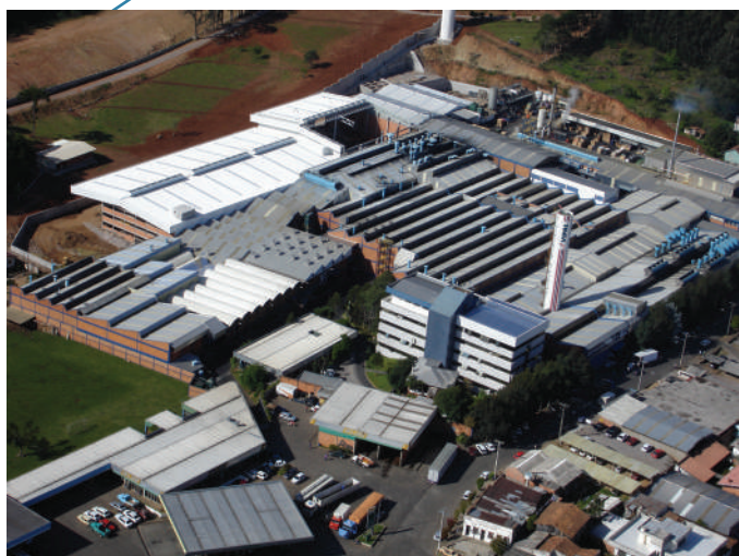
FACTORY I IN NOVA PRATA / RS - BRAZIL