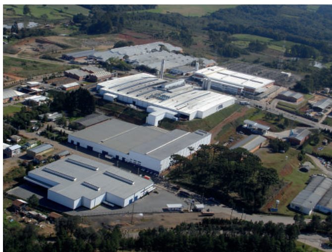
FACTORY II IN NOVA PRATA / RS - BRAZIL